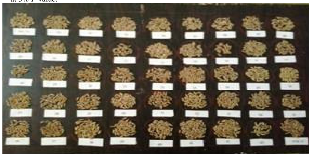
Figure 2. Grain color of F_2 population of wheat.