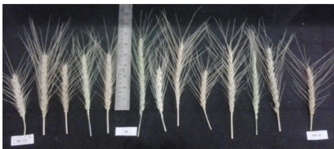
Figure 3. Variability in spike length of F_2 population of wheat.